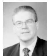
Ken Wood Credit Union Centre