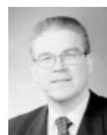
Future Opportunities Ken Wood Credit Union Centre